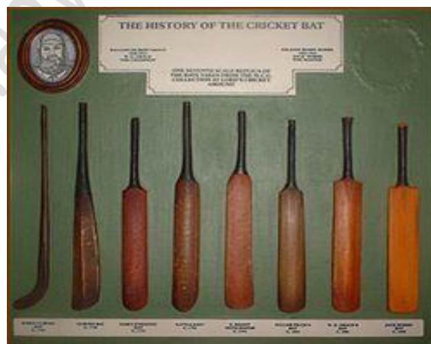
Evolution of Cricket bat