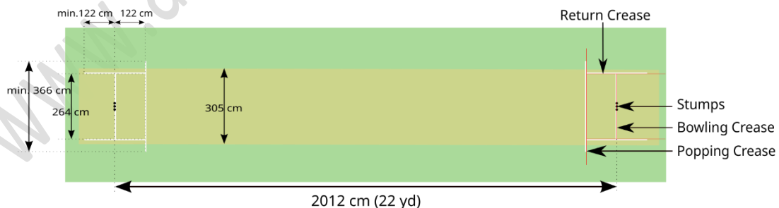
Cricket pitch, with dimensions