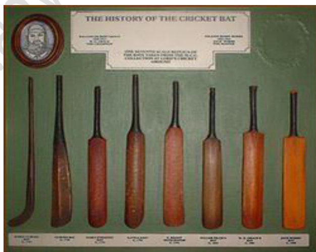
Evolution of Cricket bat