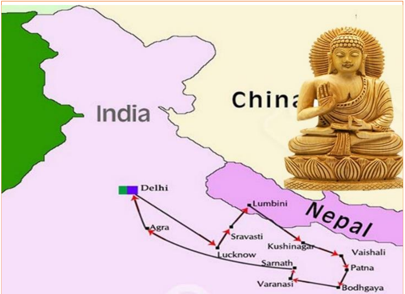
Illustrative Map of Buddhist Circuit