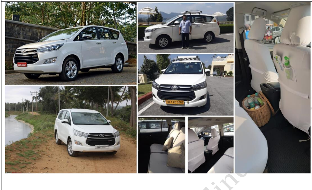
Airconditioned Toyota Large Car (sits upto 4 persons)