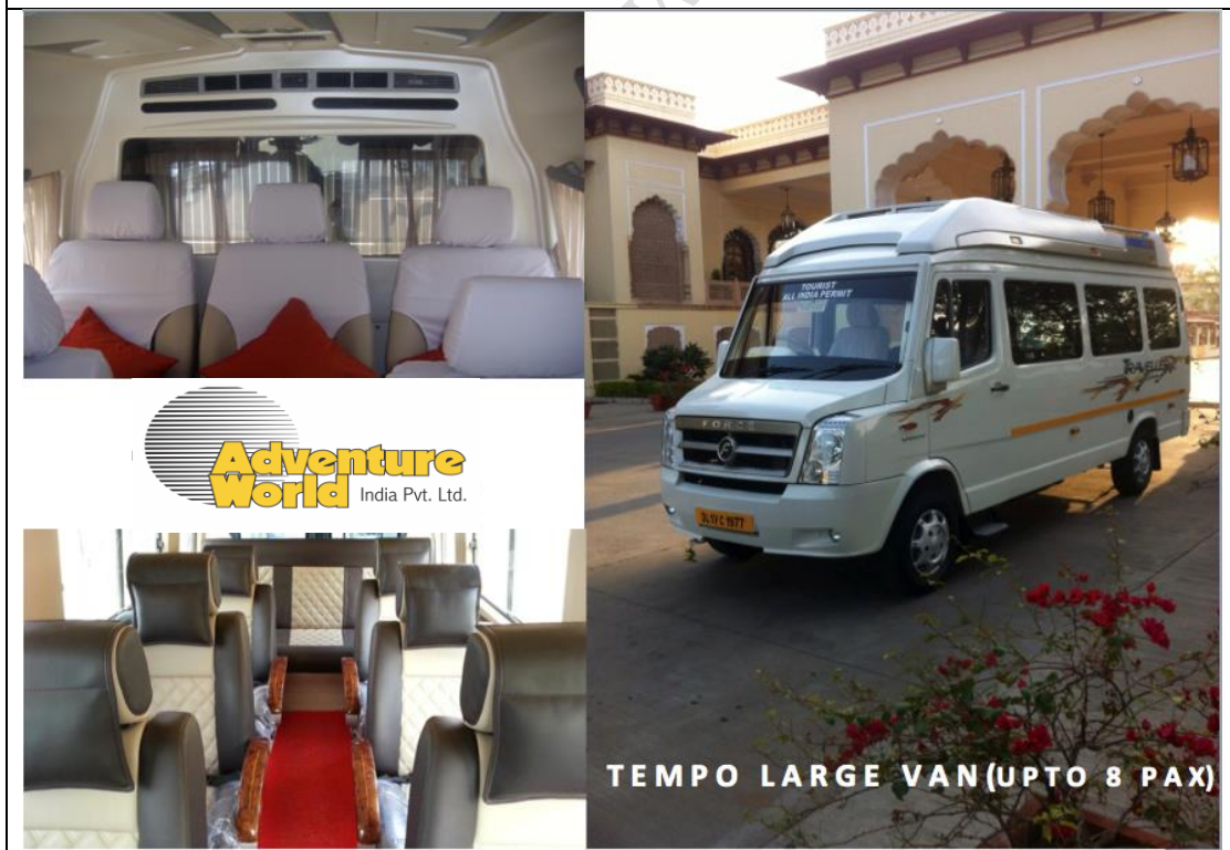
Airconditioned Tempo Traveller (sits upto 8 persons)