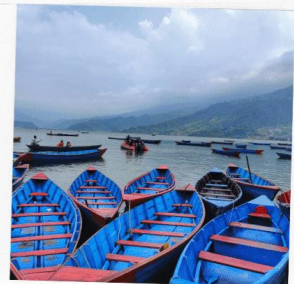
Boating at Fewa