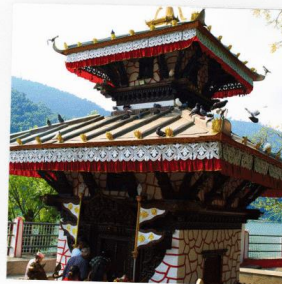
Tal Barahi Temple