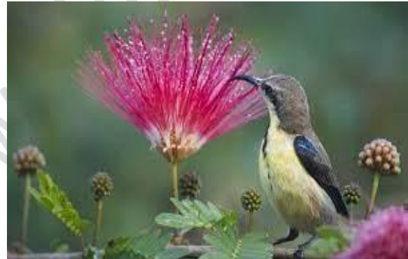
Bird in Bardiya National Park

Wake up early and prepare for the day's adventures with a hearty breakfast. Then strap on your walking boots, take a sturdy bamboo walking stick and prepare for a day of pure exploration and excitement! There will be a premade lunch ready along with refreshments to keep you going through the day. A Land Rover will take you to the National Park Entrance and in to the very heart of the national park. Your day will be spent in the Land Rover and on foot scouting out the undergrowth for those elusive big cats.