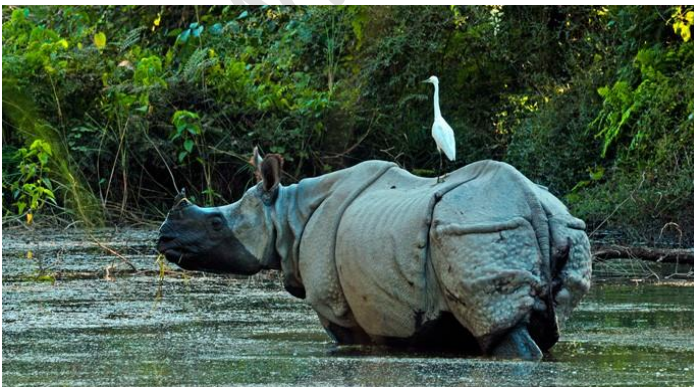
Rhino in Bardiya National Park