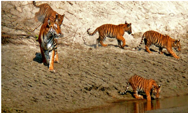
Tigers in Bardiya National Park

At Bardiya. Full Day Engage in Various Jungle Activities.