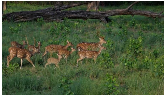
Deer in Bardiya National Park